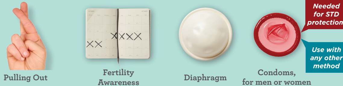
Pulling Out Fertility Awareness Diaphragm Condoms, for men or women