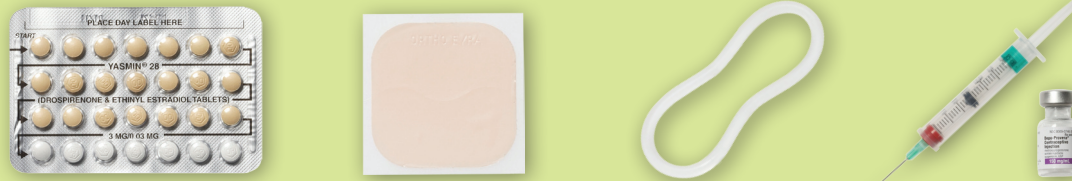
The Pill The Patch The Ring The Shot (Depo-Provera)

For it to work best, use it... Every. Single. Day. Every week Every month Every 3 months